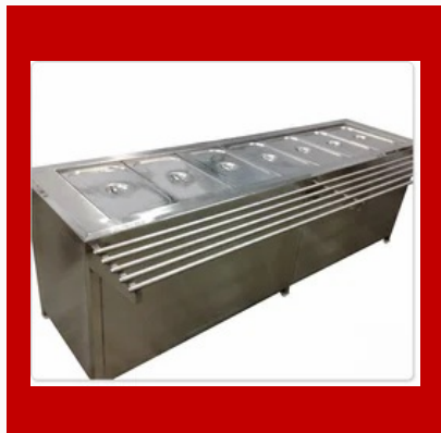
Rectangular Bain Marie Display Counter