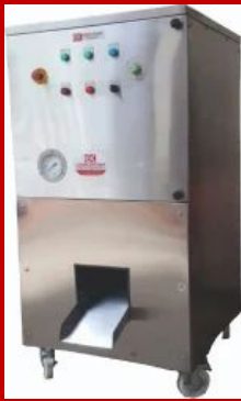
Onion And Garlic Peeling Machine