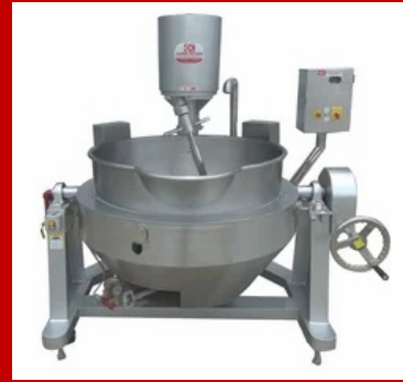
Mutton gravy Cooking machine