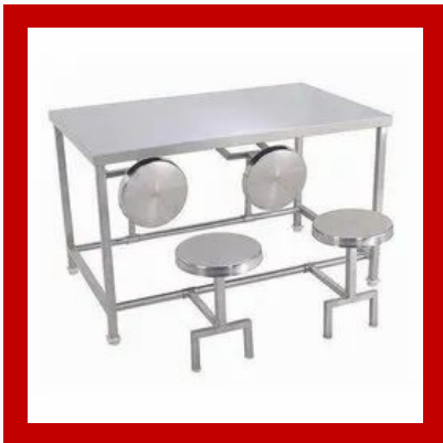
4 Seater SS Canteen Dining Table