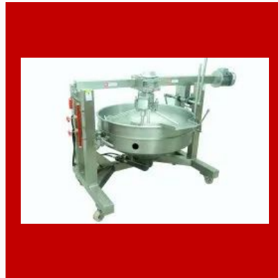
Sweets Making Machine