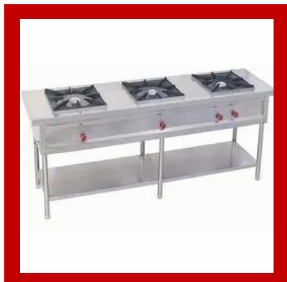
Three Burner Continental Range