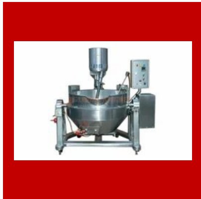
Automatic Cooking Mixer Machine