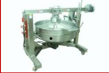
Khoya Making Machine