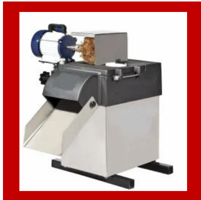
Banana Slicer / banana chips making