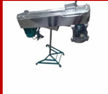
Sevai Making Machine