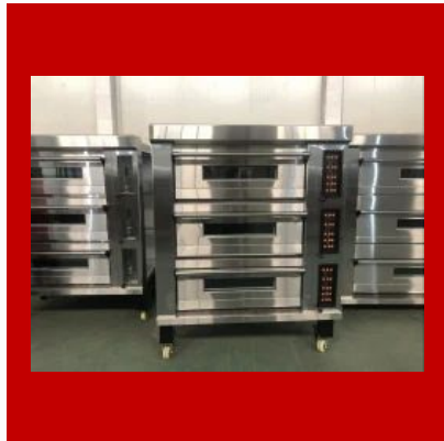
Commercial Bakery Oven