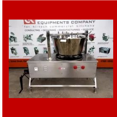
Hawa/Hawa /Khoya/Mawa Making Machine