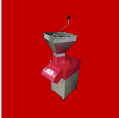
Vegetable cutting Machine Hopper (VGH500)