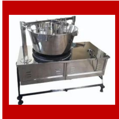
Khoya Making Machine