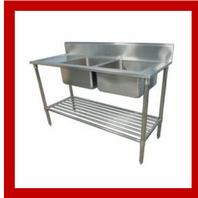
Double Sink Unit