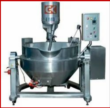
Cooking Mixer Machine