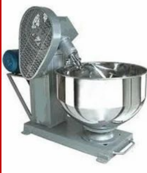
Dough Kneader Atta Kneader