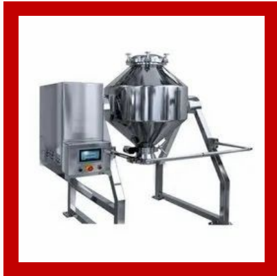
Double Cone Blender