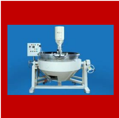
Mysore Pak Making Machine