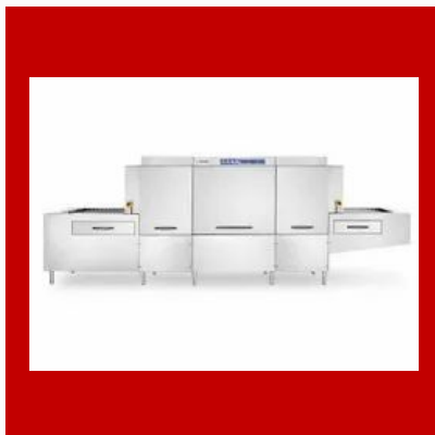
Conveyor Rackless Type Dishwasher