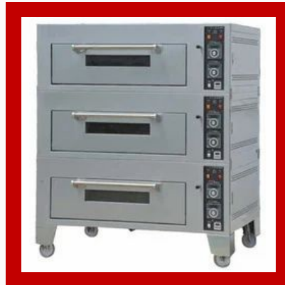
Automatic Bakery Oven