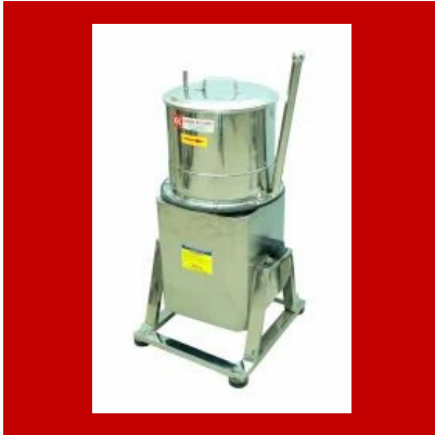
Heavy Duty Mixer Grinder