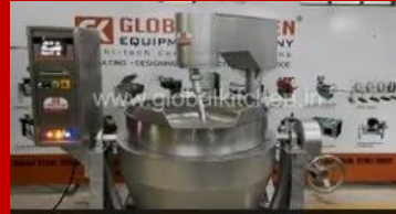
Induction Cooking Mixer Machine