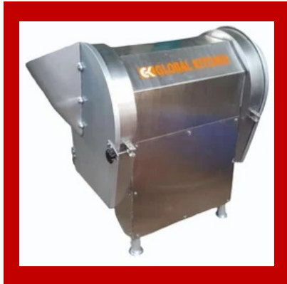
Ginger And Onion Slicer Machine