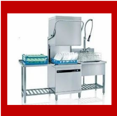
Hood Type Dishwasher