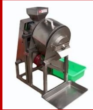
Gooseberry Shredding Machine