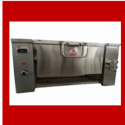
Tilting Bratt Pan