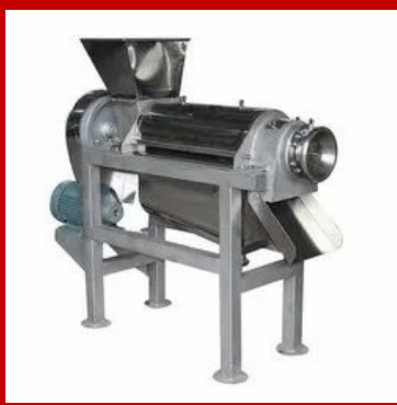
Amla Juice Extractor