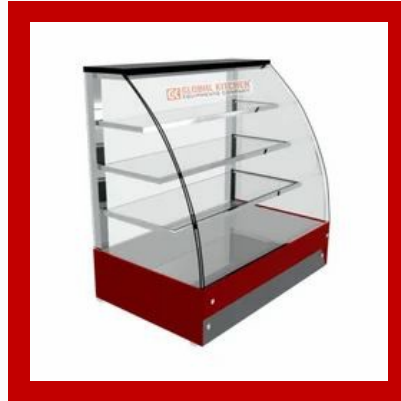
Display Counter / bakery / sweet shop