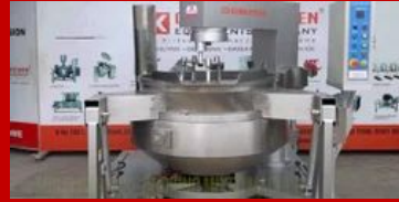
Induction gravy making machine