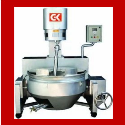
Hotel Halwa Making Machine