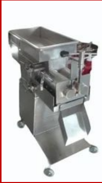
Double Screw Juice Expeller