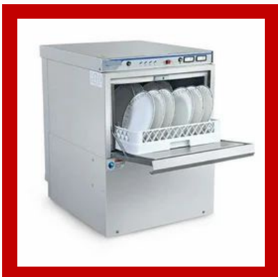
Front Loading Dishwasher