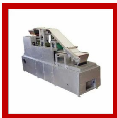
Fully Automatic Chapati Making Machine