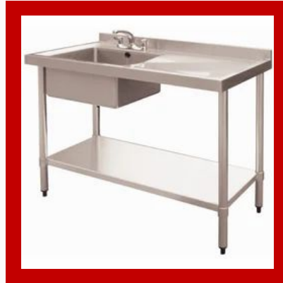
Sink With Work Table