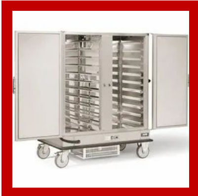
Food Transport Trolley