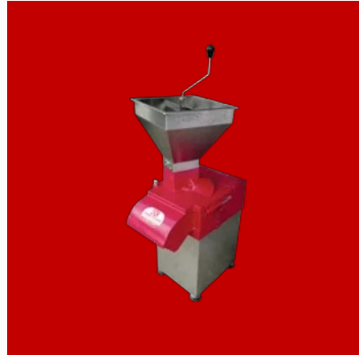
Vegetable Cutting Machine ( VGK 500 )