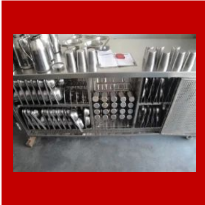
Plate And Glass Stand