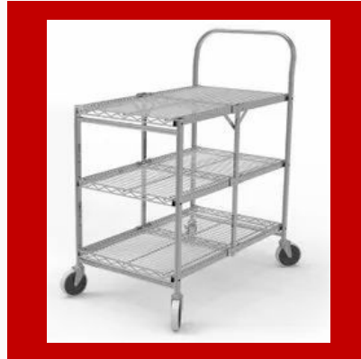
Stainless Steel Service Trolley