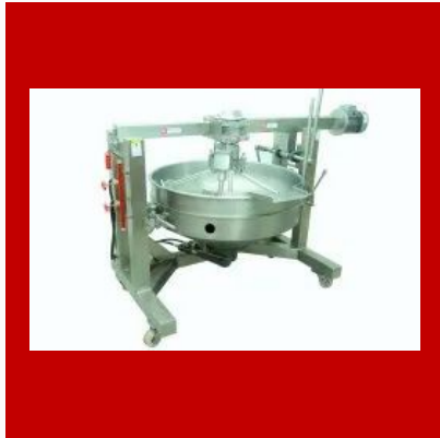
Mysorpak /Hawa /Khoya/Mawa/Kaju Kattli Making Machine