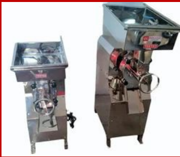
SS Rice Grinder