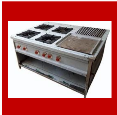
Four Burner Continental Cooking Range