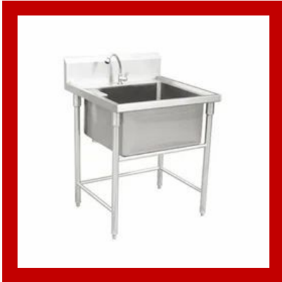
Single Sink Unit