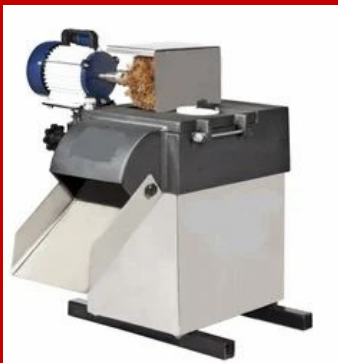
Banana Slicer/ Banana chips machine