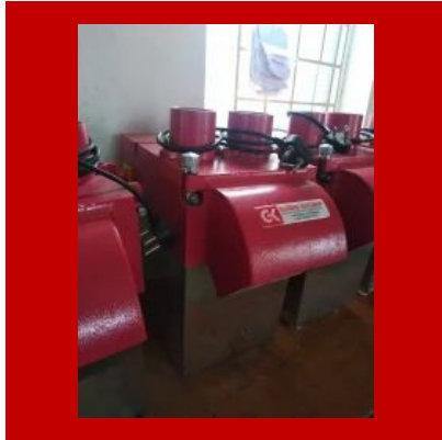
Maravalli Cutting Machine ( Slicing & Finger Fry)