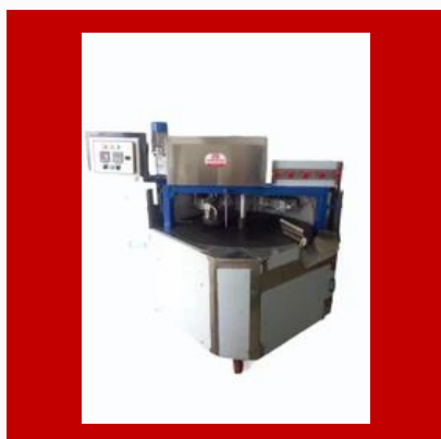
Fully Cooked Chapathi Making Machine