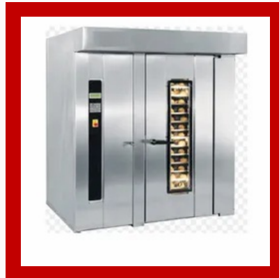
Rotary Rack Oven