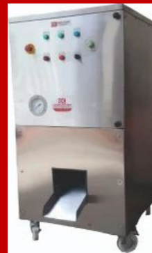
Onion And Garlic Peeling Machine