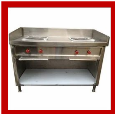
Fully Closed Type Double Burner