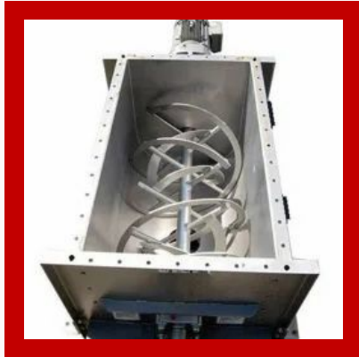
Ribbon Blender Mixer