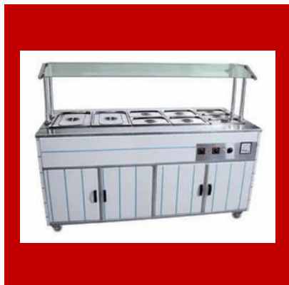
SS Bain Marie Display Catering Counter