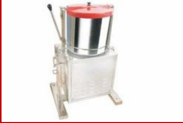
5 Lifting Wet Grinder