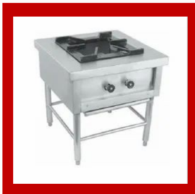
Single Burner Cooking Range