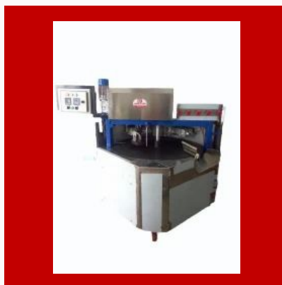
Automatic Rotary Chapati Making Machine