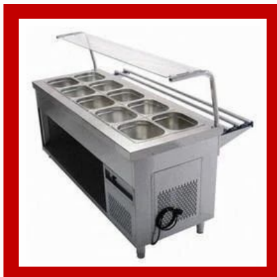
SS Electric Bain Marie Display Counter