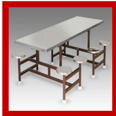
8 Seater Steel Dining Table