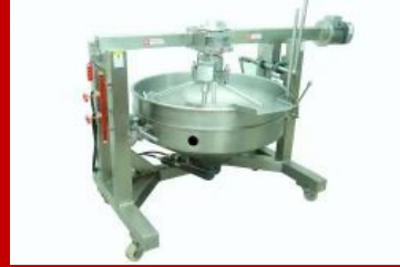
Induction Sweets Making Machine