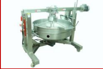
Mysore Pak Making Machine