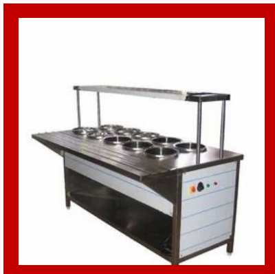
Commercial Stainless Steel Bain Marie