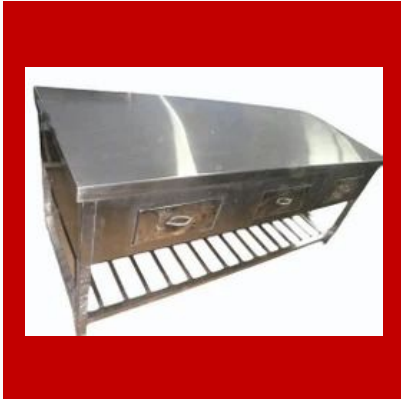
Work Table With Drawers