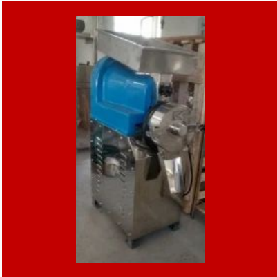
Instant Masala Grinder Machine