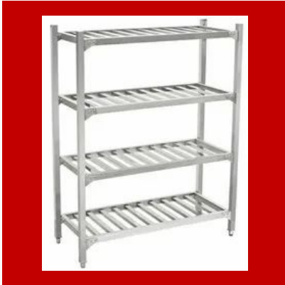
Kitchen Storage Rack