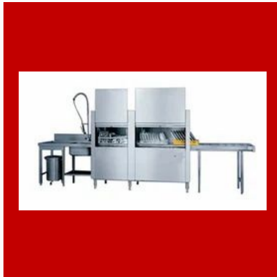
Rack Conveyor Type Dishwasher