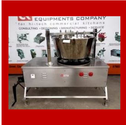
Halwa Making Machine