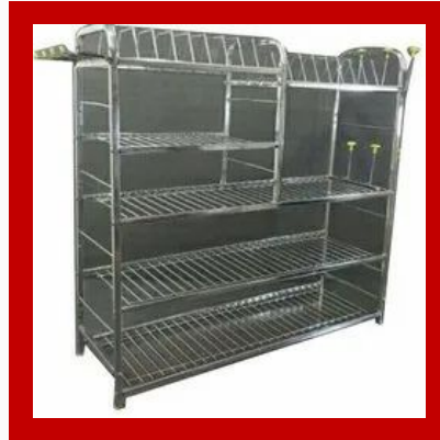
Kitchen Rack / storage rack