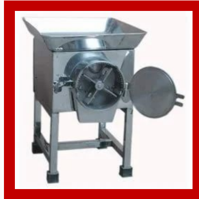
Gravy Machine / chutney machine