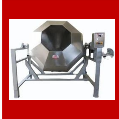
Octagonal Blender / puliyodharai mixer