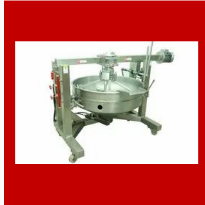
Sweet Making Machine