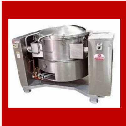
Pressure Cooker( GK )