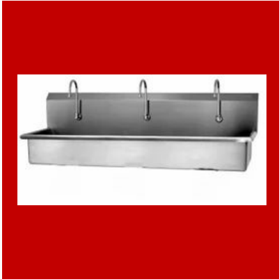
Wall Mounted Kitchen Sink