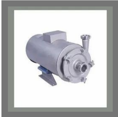
Stainless Steel Centrifugal Pump