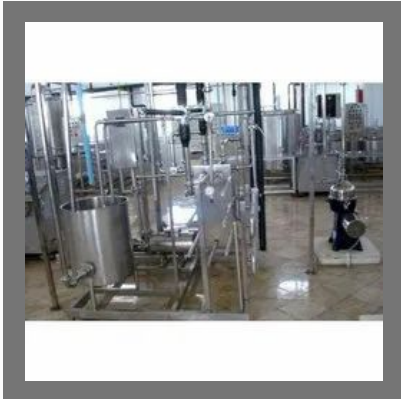
Skid Mounted Milk Pasteurizer With Cream Separator