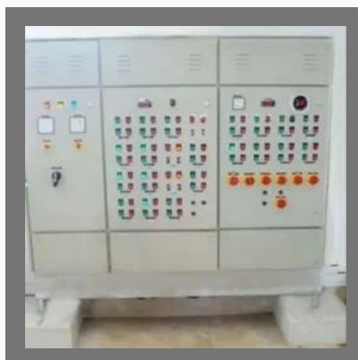
Control Panel For Milk Processing Plant