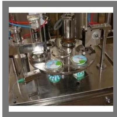
Yoghurt/Dahi Cup Filling Machine