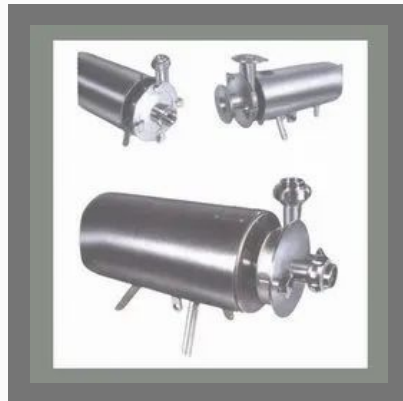
Centrifugal Pump With Various Connections