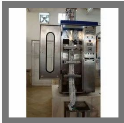
Interior Of Pouch Filling Machine