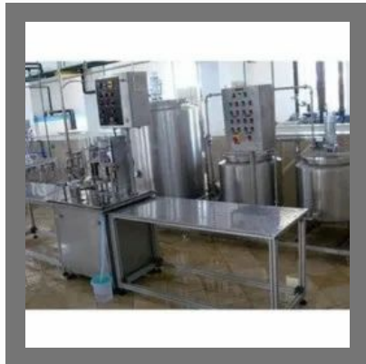
Dahi Processing Plant