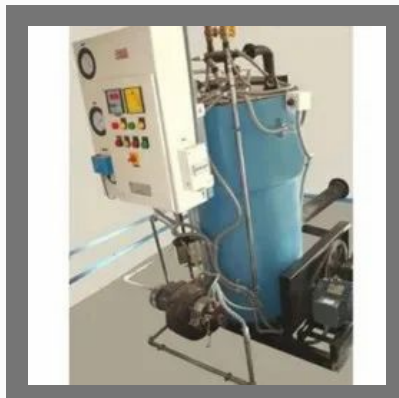
Hot Water Generator