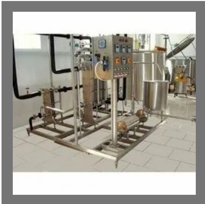
Milk Pasteurizer With Control Panel