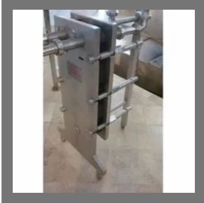
Plate Heat Exchangers