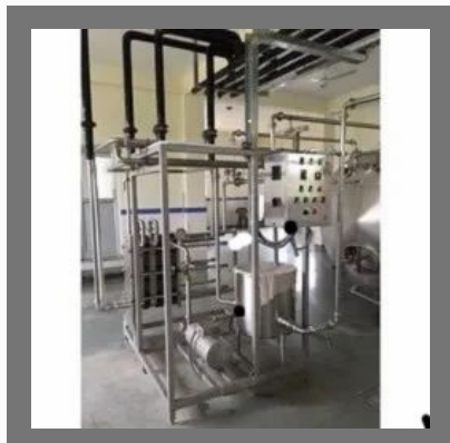
Milk Pasteurization Plant