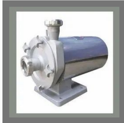
Centrifugal Pumps With Base