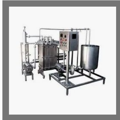
Skid Mounted Milk Pasteurizer