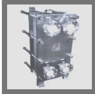
Plate Heat Exchanger