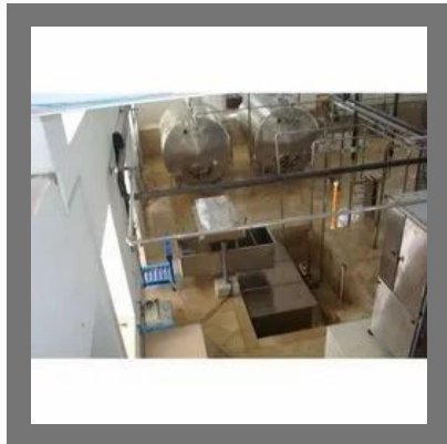
Milk Reception, Chilling & Storage Section