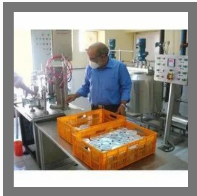
Dahi Processing And Packing System