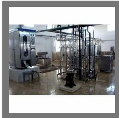
Milk Pouch Filling Machine And Milk Pasteurizer