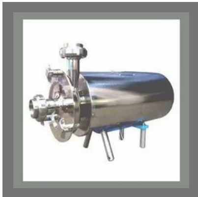
Centrifugal Pump With Legs