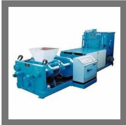
Metal Briquetting Press