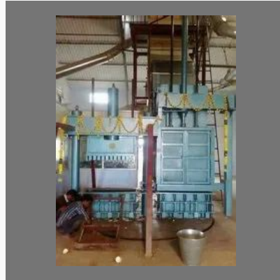
Coir Fibre Baling Machine