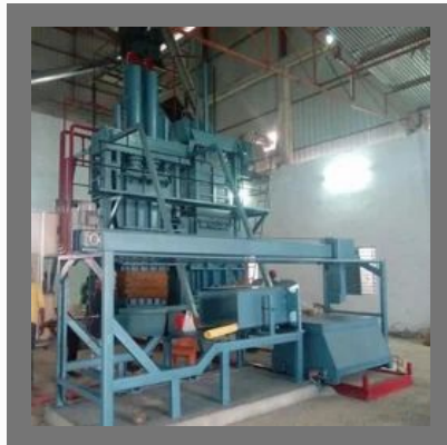
Fully Automatic Cotton Baling Press