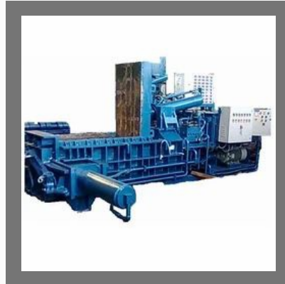
Scrap Baling Press