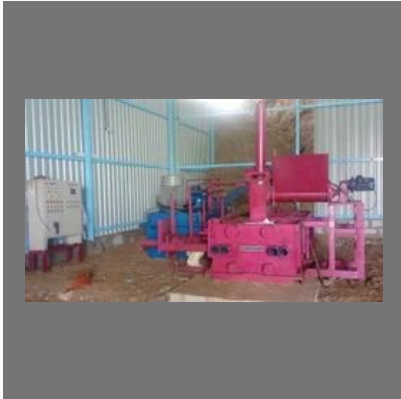
White Coal Briquetting Machine