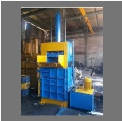
PET Bottles Baling Press