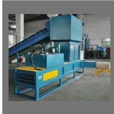
Maize Silage Bagging Baler