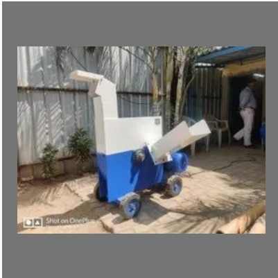
Portable Paper Roll / Tube Shredding Machine