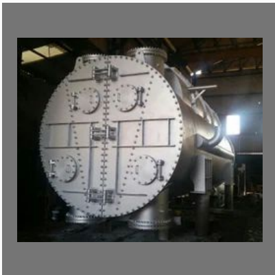
Surface Steam Condenser