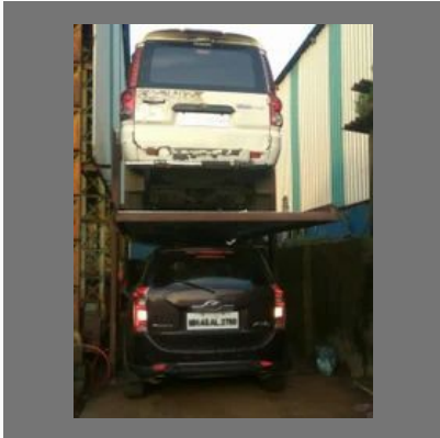
Car Parking System