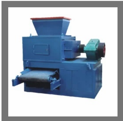
Briquette Press Machine