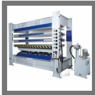
Hot Press Machine For Lamination Wood Working Industries