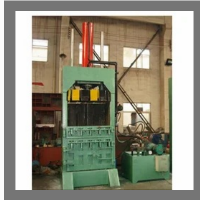
Non-Metal Hydraulic Scrap Baling Presses