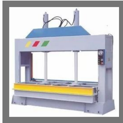
Cold Press Machine