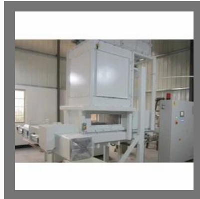
Semi Automatic Bagging Press For Synthetic Fiber