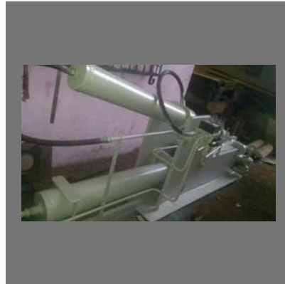
Semi Automatic Hydraulic Waste Bailing Machine