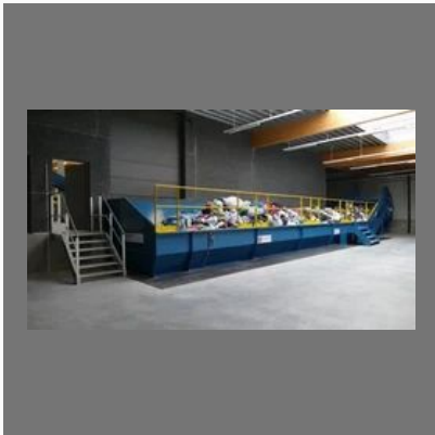
Baling Press for Clothing & Wiper