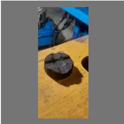
Shisha Hookah Briquettes Machine