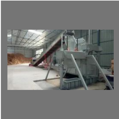
Coir Baling Press