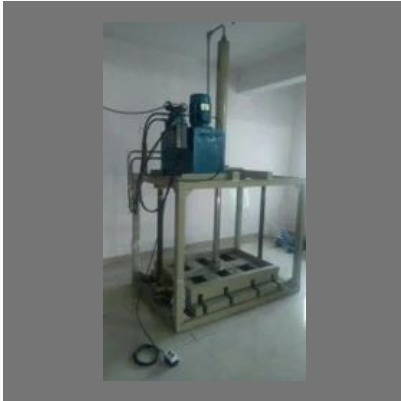
Textile Baling Press