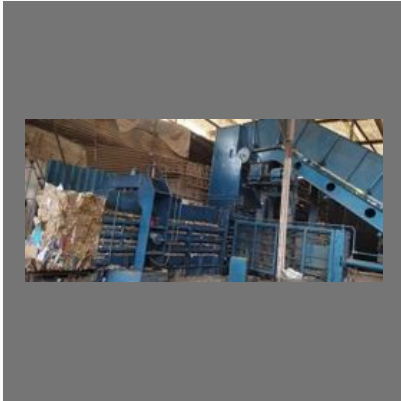
Cardboard baling press machine