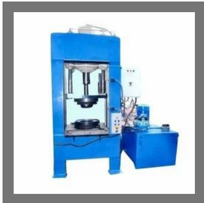
Deep Drawing Press