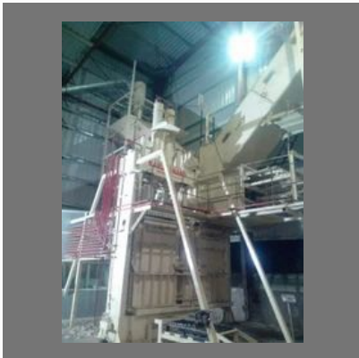
Cottonseed Delinter Bale Press