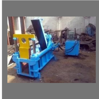
Horizontal Single Compression Scrap Baling Press