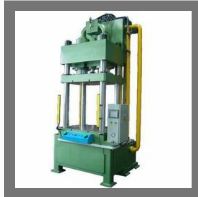
Blanking Punching Riveting Stamping Press