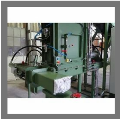
Automatic Bagging Press