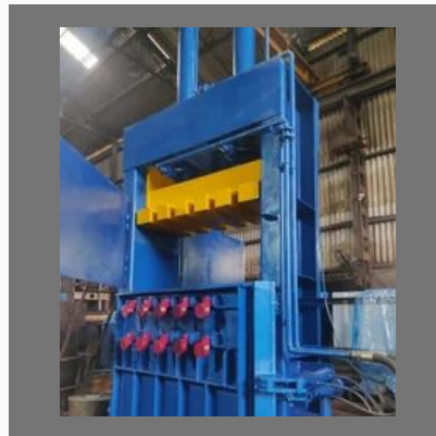
Tyre Shreds Baling Machine