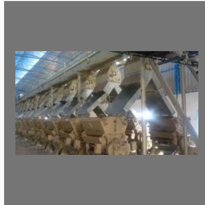
Cotton Ginning Machine