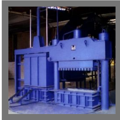
Manual Cotton Baling Press