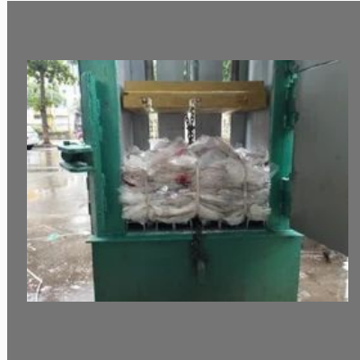
Waste Plastic Baling Machine