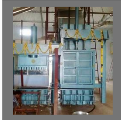
Fully Automatic Cotton Baling Press