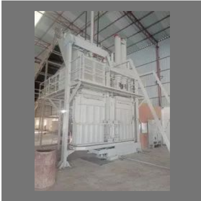
Cotton Baling Press