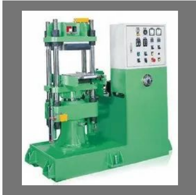
200 x 200 mm Rubber Compression Moulding Press, 30 Tons