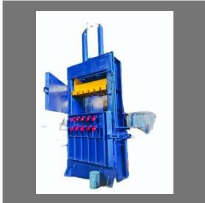
Tyre Baling Press Machine