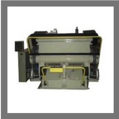
Large Platen Hydraulic Presses