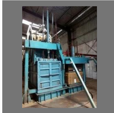
Coir Fiber Baling Press Machines