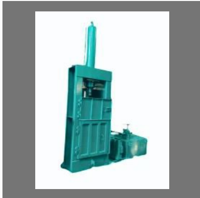
Hydraulic Baling Press