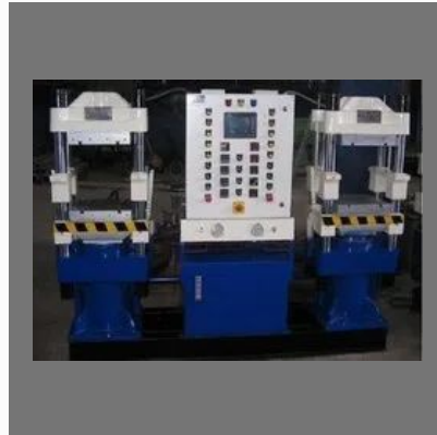
250 x 250 mm Rubber Compression Moulding Press, 60 Tons