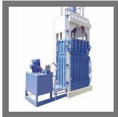
Jumbo Bag Baling Press