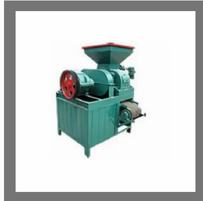
Charcoal Briquettes Machine