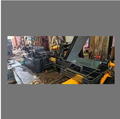
Triple Action Hydraulic Scrap Baling Press