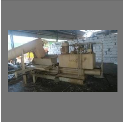
Semi Automatic Bagging Machine