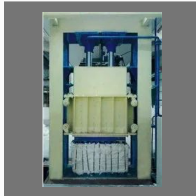
FULLY AUTOMATIC BALING PRESS MACHINE (FOR SPINNING MILL WASTE COMPLETE WITH SILO SYSTEM)